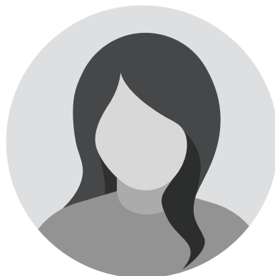
ÖZLEM TASKIN FRANCE

because, in addition to providing a productive asset, it supports service delivery that contributes to social and economic development without leaving an environmental debt for future generations. During its planning, design, construction and operation phases it can create green jobs and provide beneficiary communities with resilience in a changing climate.